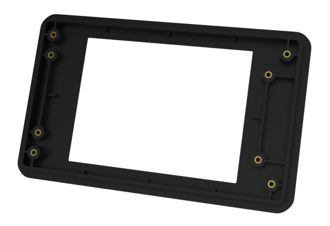
Bare 3.2" Bezel - Back